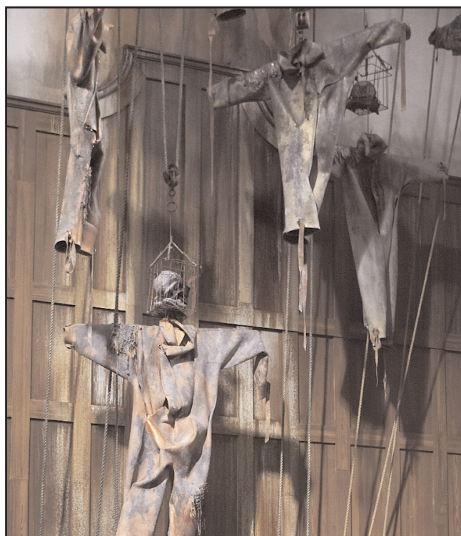
Miners’ suits recovered from Silent Hill fire.

beautiful hotel allowed to rot like that,” McCabe says. “But it’s good that people just stay the heck away from that place.” ■